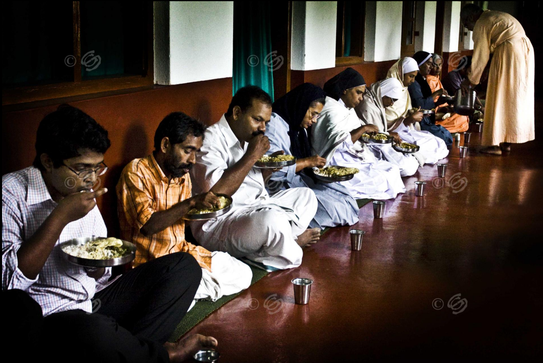
The meals are experienced as a ritual. The lunch and dinner are consumed in the corridor of the monastery in holy silence