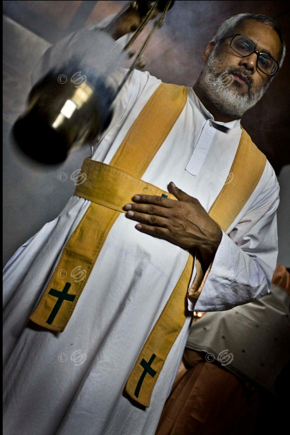
5:30 AM. First morning prayer. This involving liturgy is an expression of the deep Benedictine Cistercian tradition.