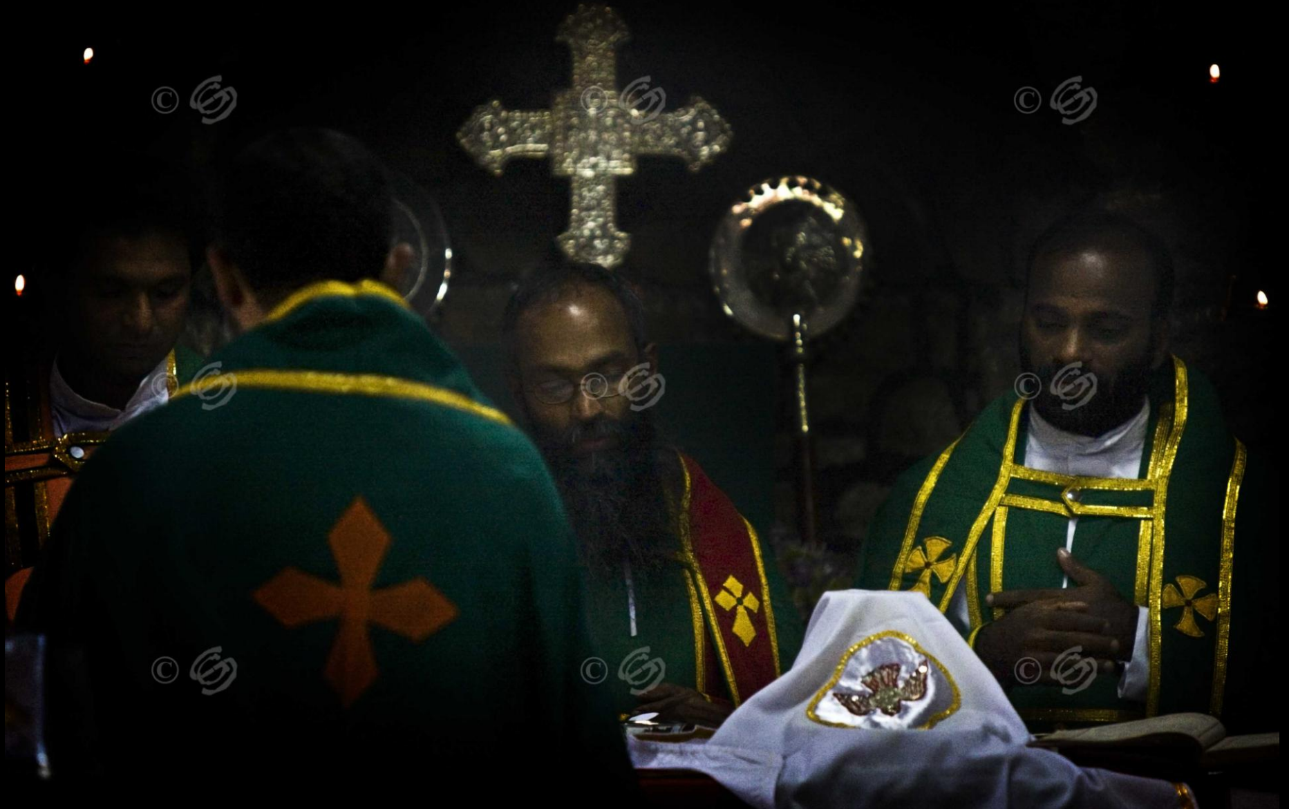
The Syrian liturgy has a ritual similar to the Christian mass. The monks wear green tunics and in turn lead the celebration.