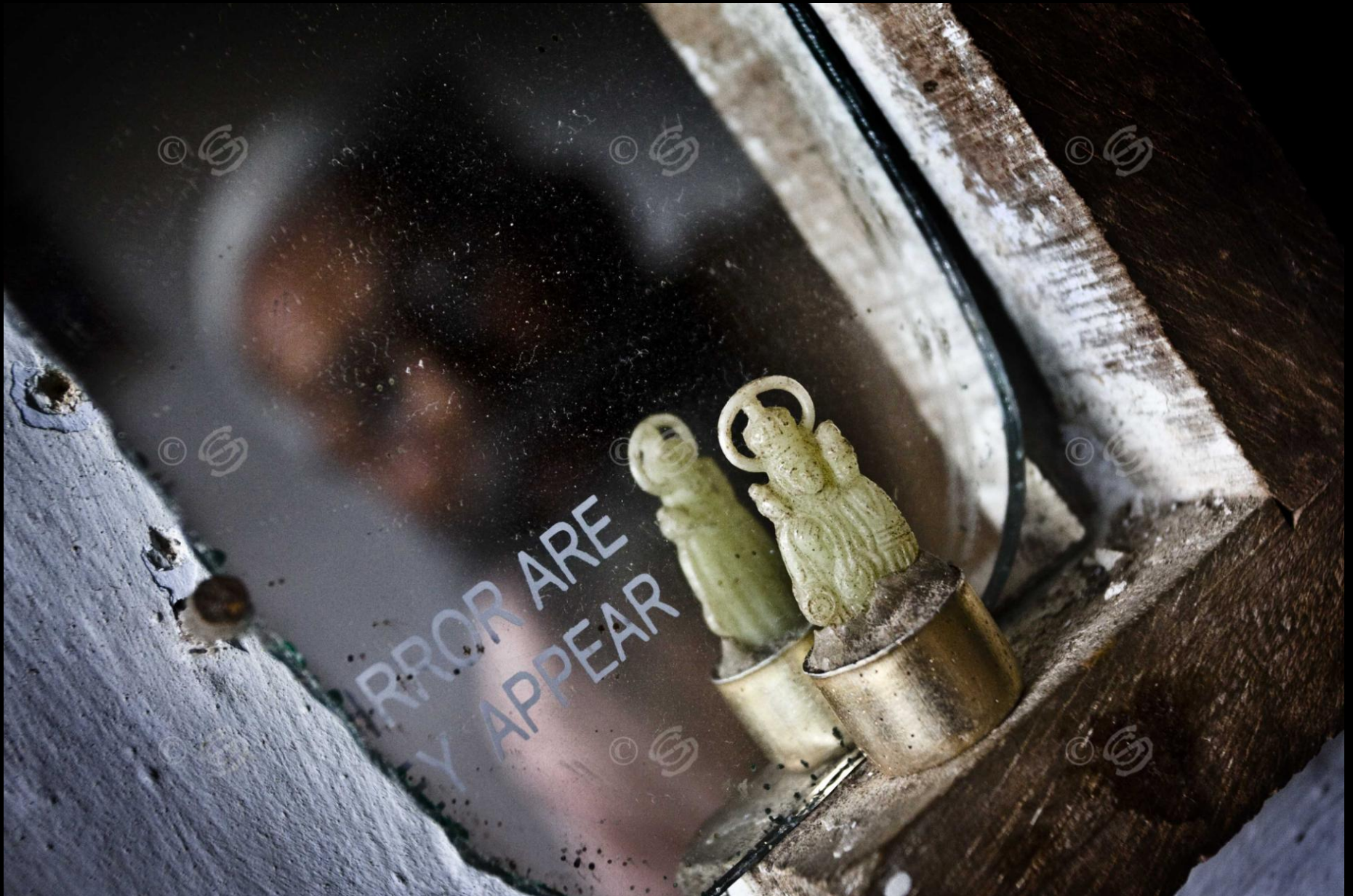
The objects in mirror are closer than they appear. These words written on a piece of rearviewmirror explain exactly the Kurisumala Ashram soul.