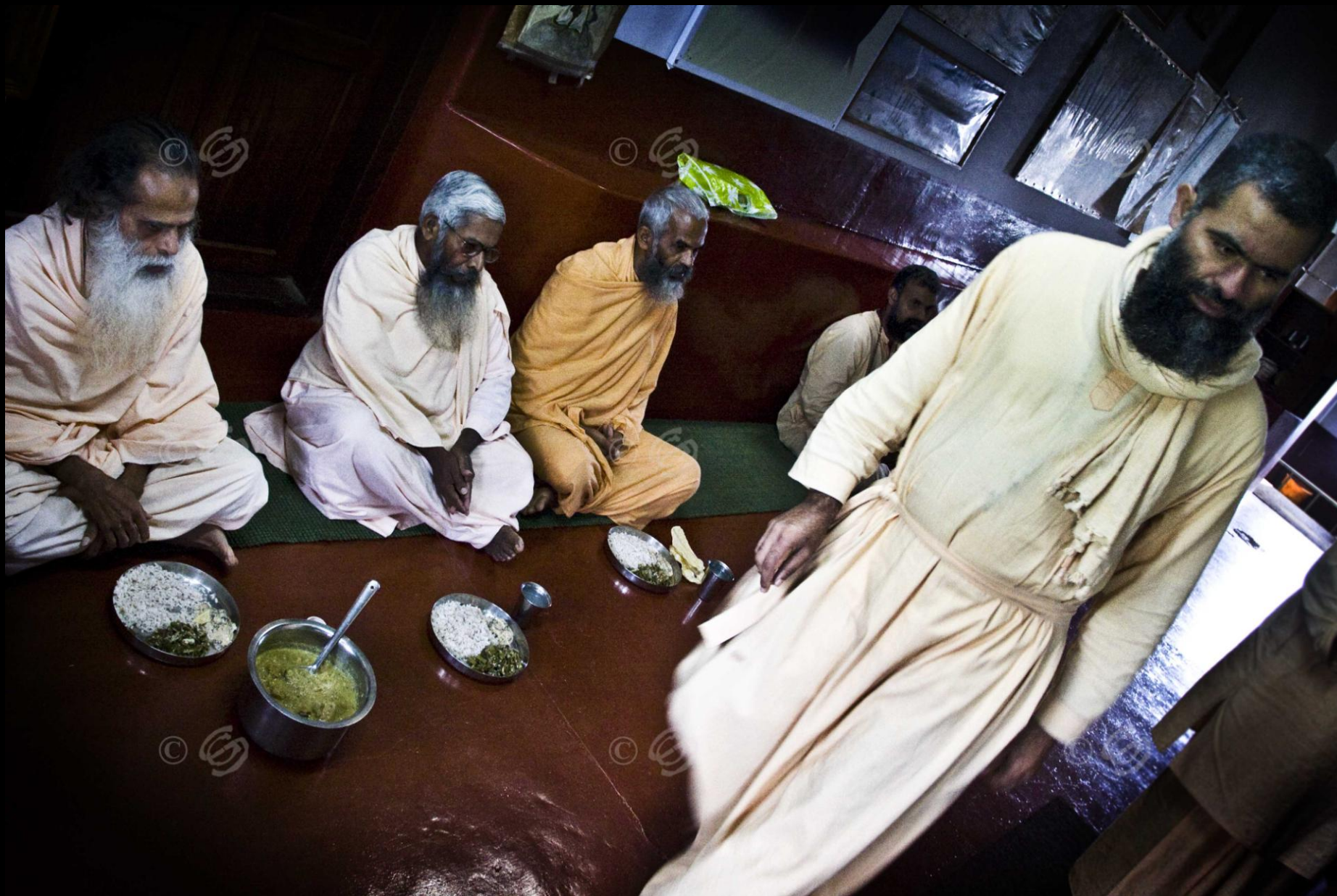
In turn, the monks serving the meal after reciting a prayer of thanksgiving. They eat by their hands and accept the food as a precious gift.