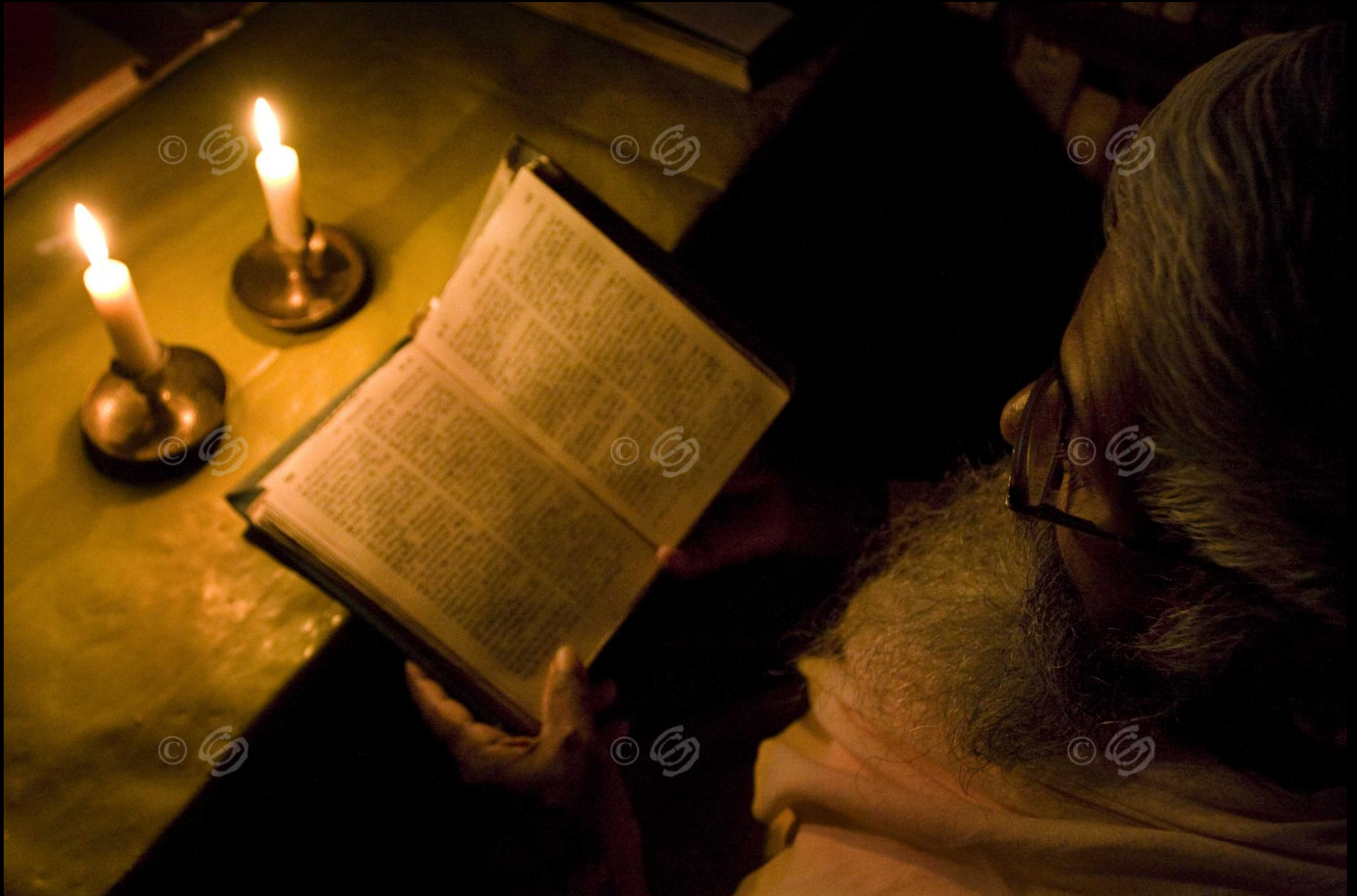
In the library of the monastery is possible to find many books of theology and philosophy in addition to the holy Christianity and Hinduism books. The candle lights verses of the Bible that this monk reads like a mantra.