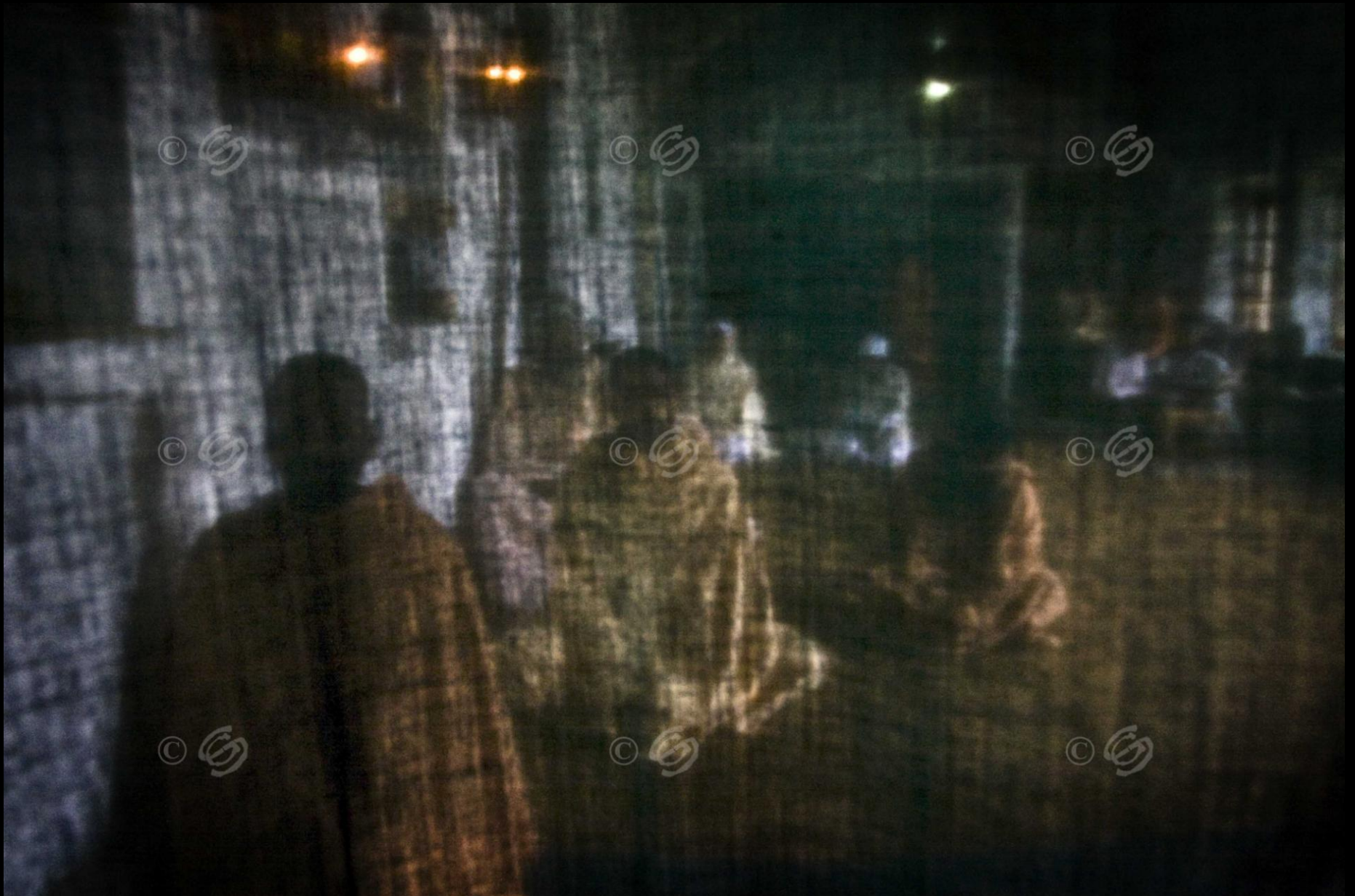
The Hindu meditation culture is an essential tool for the soul searching. To reach different levels of awareness requires practice and dedication. Sitting in the lotus position, in complete silence, these monks are concentrating their mind to bring it beyond the barrier of reality.