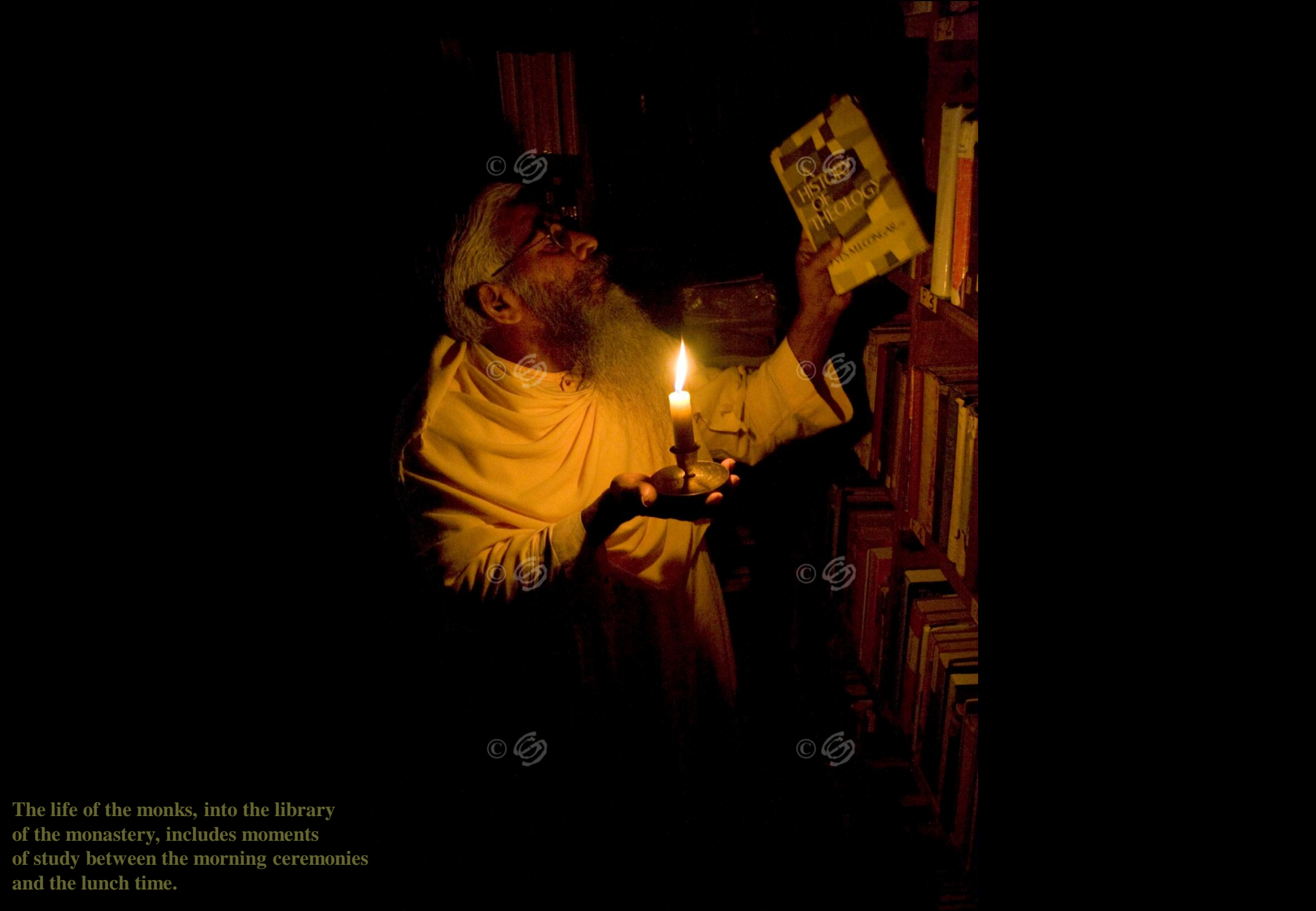
The life of the monks, into the library of the monastery, includes moments of study between the morning ceremonies and the lunch time.